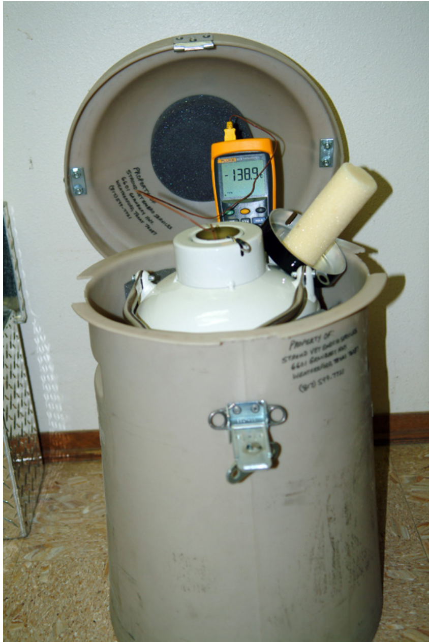
Figure 2. Dry shipper 10 days post charging with liquid nitrogen. Temp – 138.9° C

Plastic goblets snapped onto canes inside dry shippers will not have liquid nitrogen in them, so time in the neck of the shipper should be kept to a minimum when viewing or handling the contents. The eight second rule also applies to dry shippers. Canes of semen or embryos should be transferred swiftly from a dry shipper to a storage vessel to prevent possible damage during movement.